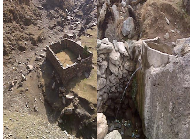
Fig. 5 Photograph of Chinodog (left side) and Tehran water spring (right side).

share of precipitation are served as a source of running water. Due to the high rate of evapotranspiration by eucalyptus from rock reservoirs, the springs have become dry and the area has lost the share of spring water in the river. It shows that the Eucalyptus tree is more dangerous to the water table, groundwater, rock reservoirs, and springs. Therefore, serious consideration must be given to the fact that the plantation of Eucalyptus is stopped on the mountain slopes as well as in the lowlands of Pakistan.