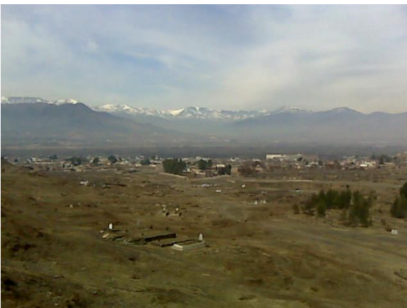
Fig. 2 Areal view of Udigram village (Source: Field Photography).

As far as the Indo-Pakistan is concerned, the Capt. Dryas (1860) was the first, who planted the Eucalyptus tree in Punjab province, Pakistan. Hence, the Parker (1952) has introduced Eucalyptus plant throughout the plane and hill physiographies of Indo-Pakistan sub-continent. The other specific contributors consist of Khan (1955), Ahmad and Ruhullah (1982), Akbar and Tariq (1992), Akbar, et al. (1992), Rafique (1995), Boden (1968), Chippendale (1973), Parameswarappa, et al. (1997), Jackson, et al. (2005), Sohail and Sulaiman (1999), Aslam, et al. (2018), Zhang (2012), Tome and Barreiro (2012), Planisami and Joshi (2011), Ali, Bilal and Nisa (2014), etc.