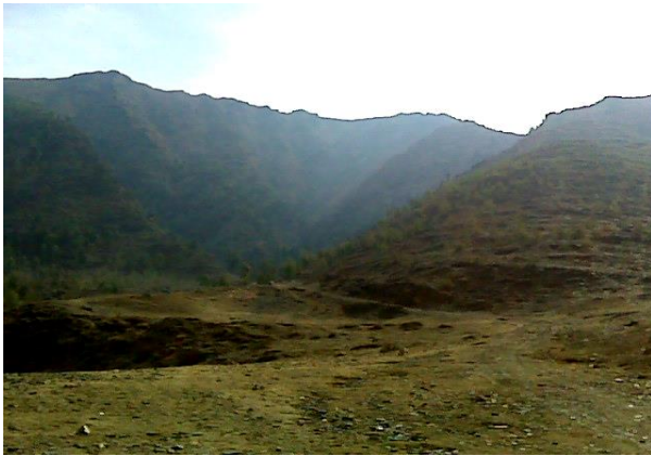
Fig. 4 Plantation of Eucalyptus on Raja Gira Mountain.

areas to surface bodies of water wetlands and springs areas of evapotranspiration and other water-collection devices.