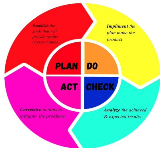
Fig. 3 Establishment of PDCA model and their role in hospital management (modified from Poh et al., 2000).

GHL is providing health facilities to people from all over Pakistan. GHL is a large health care unit which is situated in Lahore with all the comprehensive medical facilities. The hospital has a daily admission of patients of more than 2000. To boost the environmental process and practices, a successful EMS was created on the "Plan, Do, Check, Act" (PDCA), which show epitomizes the perception of persistent advancement (Fig. 2).