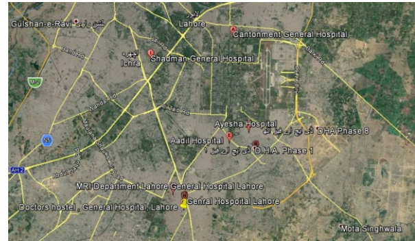
Fig. 1 Map showing the study and location of General Hospital Lahore.

devices. Apart from these, there are sophisticated backup systems, a substantial medical system, and complete infrastructure, which are very rare and unique facilities (Janius et al., 2017).